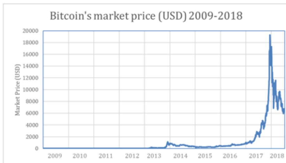
Figure 1: Bitcoin's market price 2009–2018

In sum, the empirical evidence from Bitcoin's financial records appears to contradict the claim that Bitcoin can provide a stable means of payment and store of value, in line with the theoretical prescriptions of Friedman and Hayek.